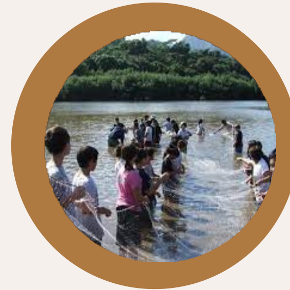
Waikalua Loko I'a - Hawaiian Fishpond Restoration/Preservation