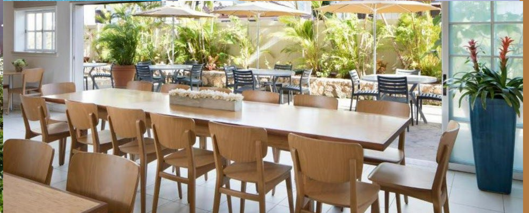
Coconut Waikiki Hotel or Similar