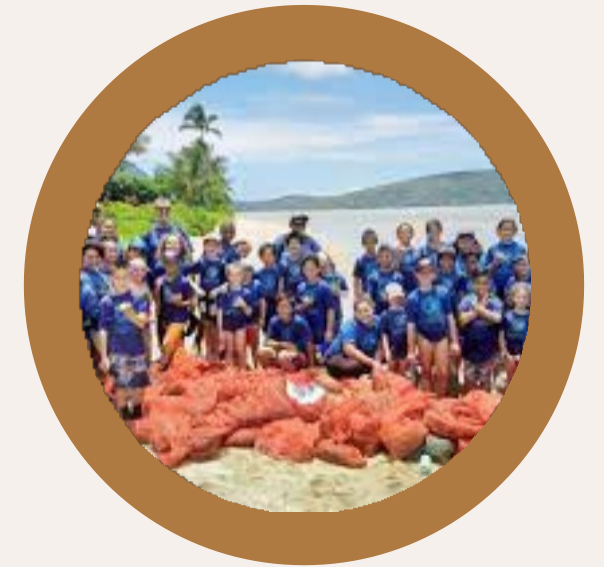
Malama Manalua - Coastal Ecosystem Restoration