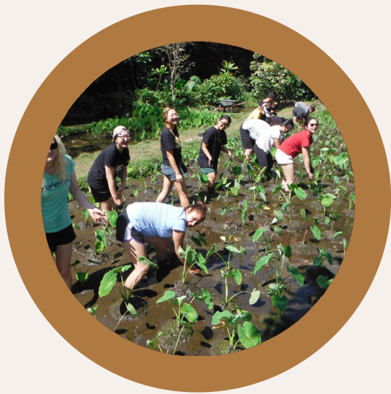
Hawaiian History/ Wetland ecosystem - Taro Fields