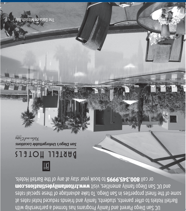
The Dana on Mission Bay